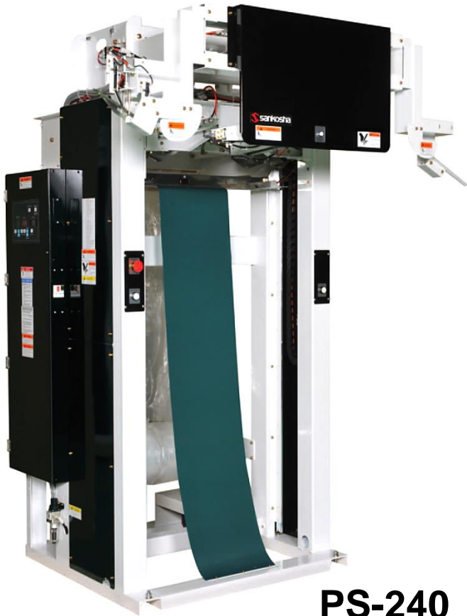
PS-240 Automatic Bagging Machine